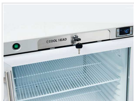
Main switch, digital thermostat and door lock fitted as standard