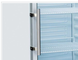
External cylindric handle in stainless steel (Steel color for X Version)