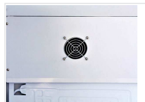
Inner assistance fan